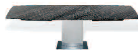
SOCKEL 6 / BASE 6