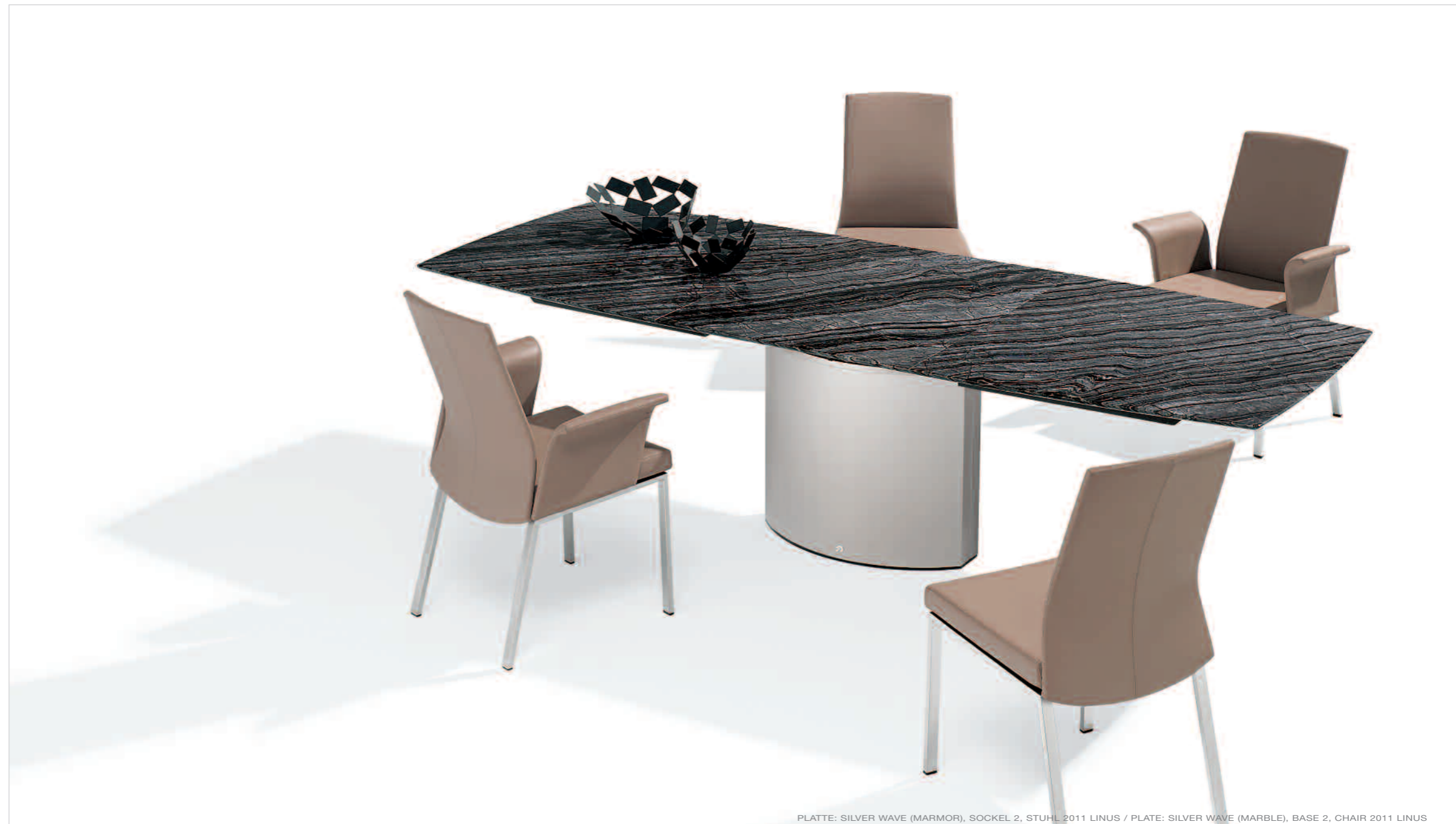
PLATTE: SILVER WAVE (MARMOR), SOCKEL 2, STUHL 2011 LINUS / PLATE: SILVER WAVE (MARBLE), BASE 2, CHAIR 2011 LINUS