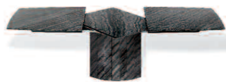
SOCKEL 5 / BASE 5