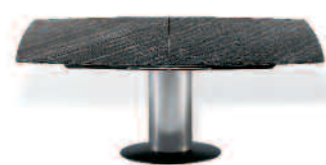
SOCKEL 4 / BASE 4