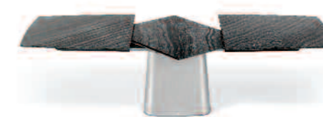
SOCKEL 7 / BASE 7